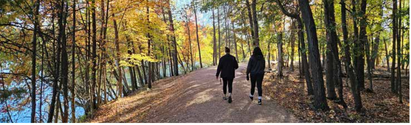
Lake Loop Trail accessibility upgrades funded by Friends of Schmeeckle in 2021